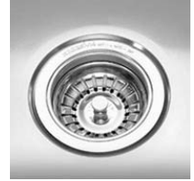
AC09 Basket Waste x 2