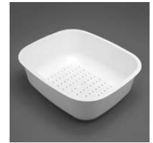
AC02 3/4 Bowl Colander