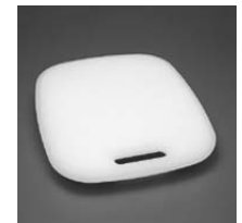
AC21 Synthetic Preparation Board